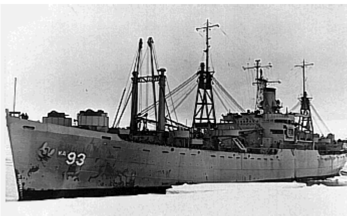
USS YANCEY DURING OPERATION HIGH- JUMP IN ANTARCTICA

Editor's Note: If you were part of Operation Highjump, we would love to hear from you about your experiences. Please send your story to us at Premier Reunion Services, PO Box 11438, Hickory, NC 28603